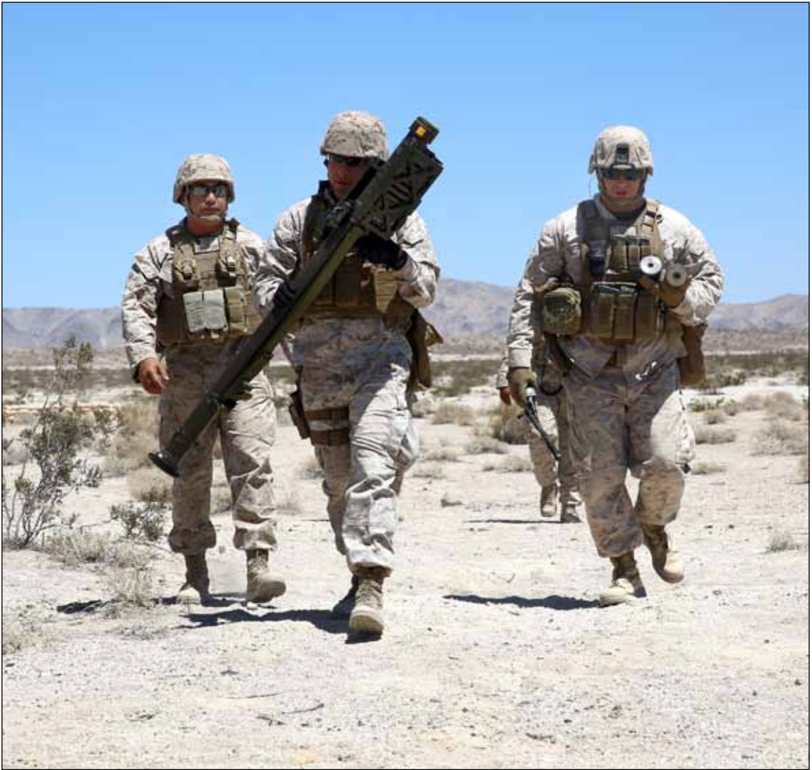
Marines with 3rd Low Altitude Air Defense Battalion return from firing a stinger weapons on Fort Irwin.