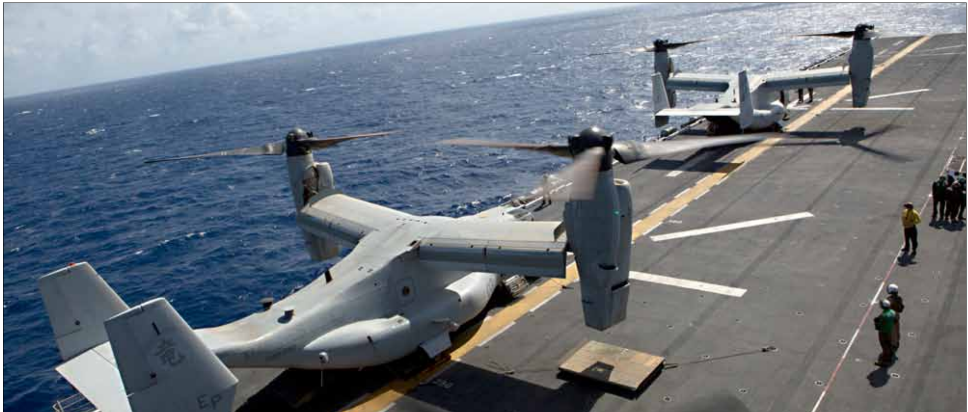
Two MV-22B Ospreys prepare to take off from the flight deck of the USS Bonhomme Richard (LHD 6), Aug. 8, 2015. The 31st MEU is staging Ospreys in Guam in support of typhoon recovery efforts in Saipan. The aircraft will be on standby in the event their aerial lift capacity is needed to deliver emergency supplies to remote areas. Saipan, the most populated island in the Commonwealth of the Northern Mariana Islands, was struck by Typhoon Soudelor Aug. 2-3.