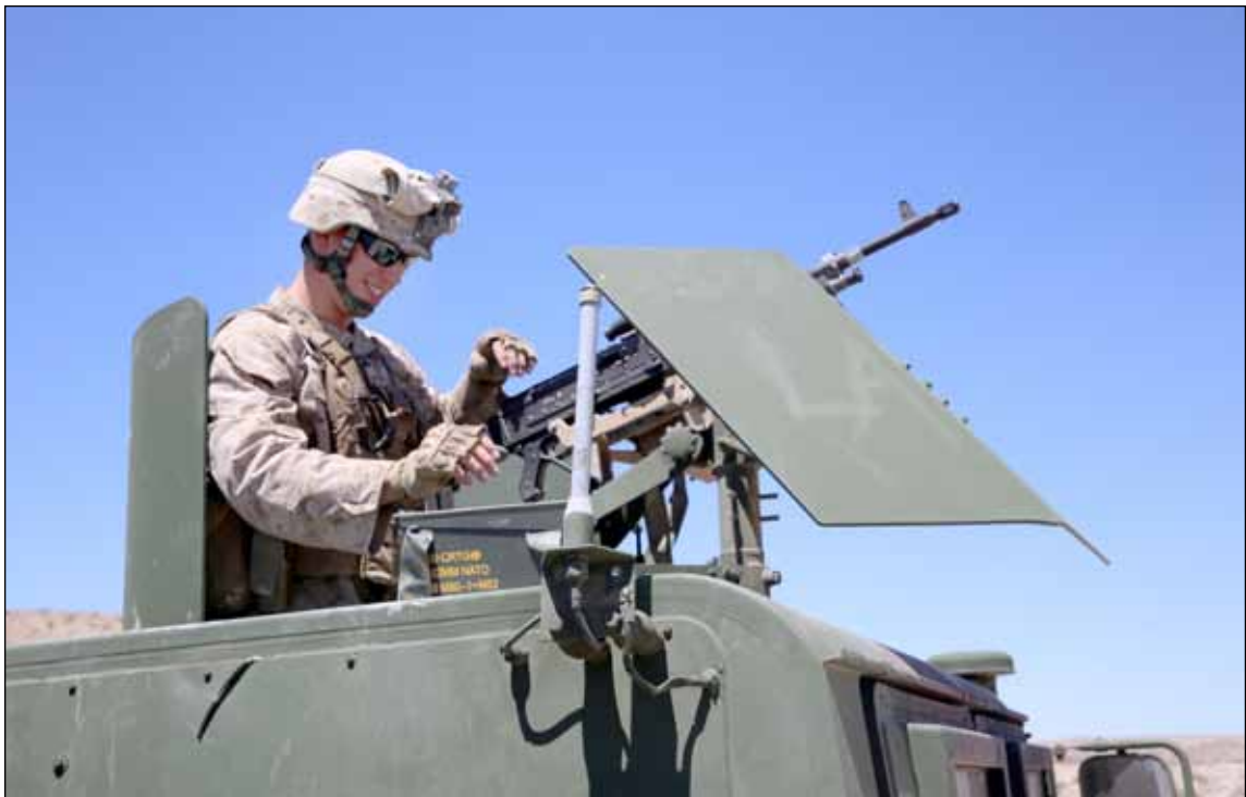
A Marine with 3rd Low Altitude Air Defense Battalion prepares a 240B general purpose machine gun for the live shoot on Fort Irwin.

STORY & PHOTOS BY LANCE CPL. KIMBERLYN ADAMS Marine Corps Air Station Miramar / 3rd Marine Aircraft Wing