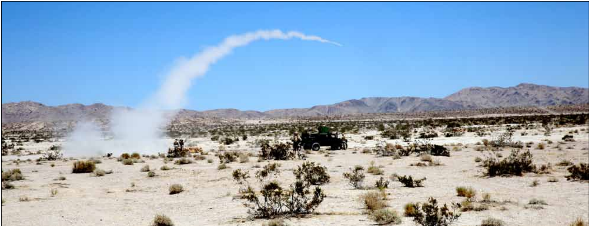
Marines with 3rd Low Altitude Air Defense Battalion (LAAD) fire stinger missiles during a live shoot in Fort Irwin, Calif., Aug. 10. Marines also fired the 50-caliber sniper rifle and the M240B machine gun during the five-day annual training.