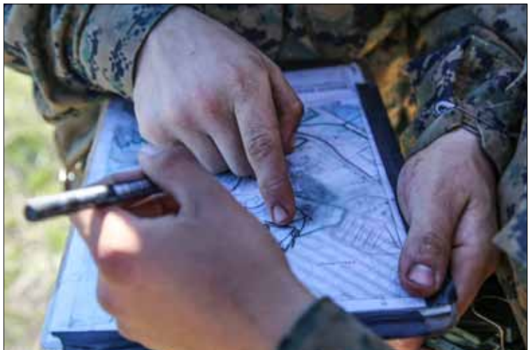
Bravo Company recruits use a map and compass to find their way to their next navigation point.