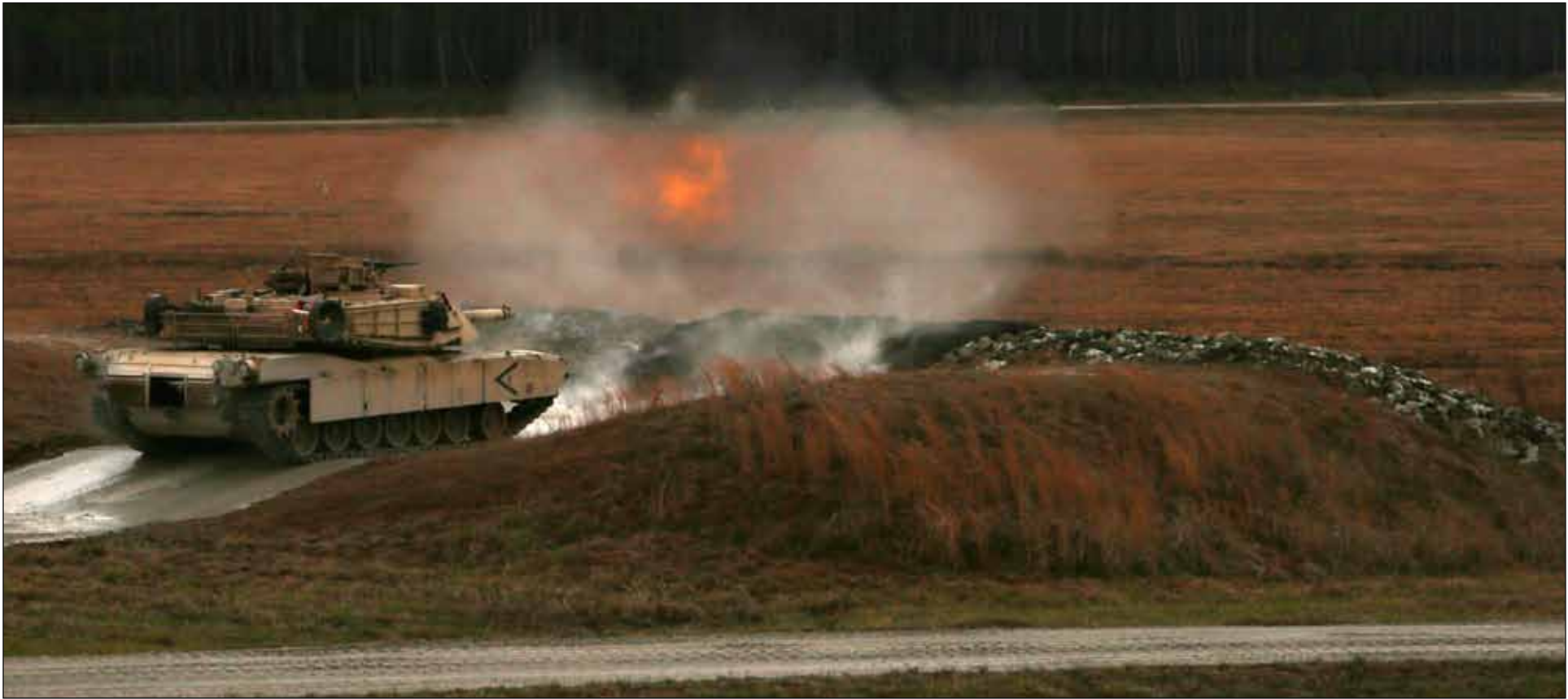
Marines with Tank Platoon, Company B, Ground Combat Element Integrated Task Force, fire the 120mm main gun of the M1A1 Abrams tank during a live-fire training exercise at Range SR-10, Marine Corps Base Camp Lejeune, N.C., Jan. 13. The Marines conducted offensive and defensive engagements to prepare for an upcoming assessment at Marine Corps Air Ground Combat Center, Twentynine Palms, Calif. From now through July, the GCEITF will conduct individual and collective level skills training in designated ground combat arms occupational specialties in order to facilitate the standards based assessment of the physical performance of Marines in a simulated operating environment performing specific ground combat arms tasks.