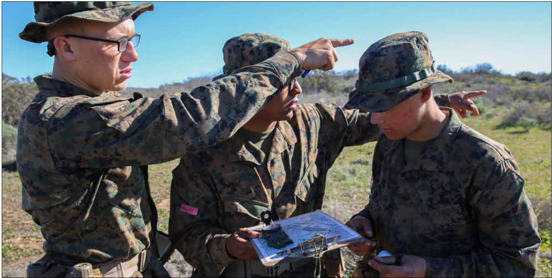
Recruits of Bravo Company, 1st Recruit Training Battalion, work together to find their way to their next point during the Land Navigation Course at Edson Range, Marine Corps Base Camp Pendleton, Jan. 6. Each navigation point is marked with a numbered ammunition can and each pair of recruits was given a different route to follow.