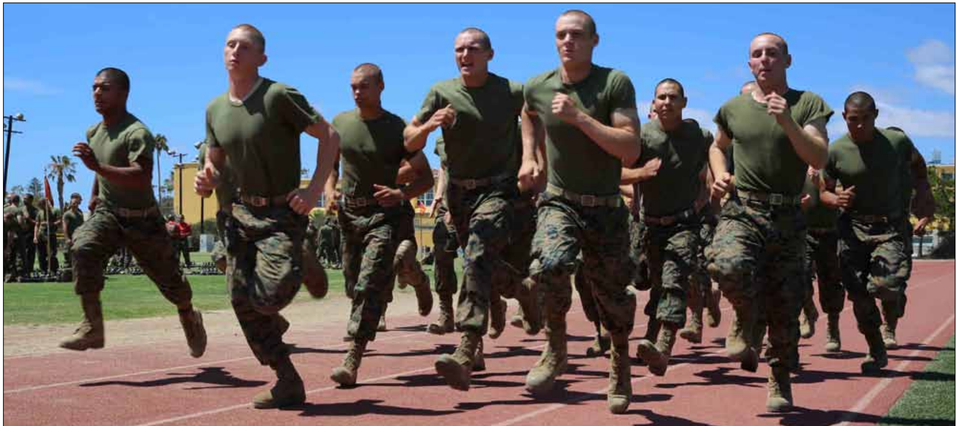
Recruits of Delta Company, 1st Recruit Training Battalion, sprint during the 880-yard run portion of the Combat Fitness Test at Marine Corps Recruit Depot San Diego, July 17. The Combat Fitness Test is comprised of an 880-yard run, ammunition can lifts and a maneuver under fire.