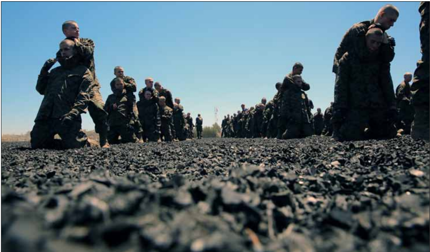
Recruits of Kilo Company, 3rd Recruit Training Battalion, place each other in chokes during a Marine Corps Martial Arts Program sessions at Marine Corps Recruit Depot San Diego, July 21. Not only do recruits learn martial arts in MCMAP, but also discipline and warrior ethos.