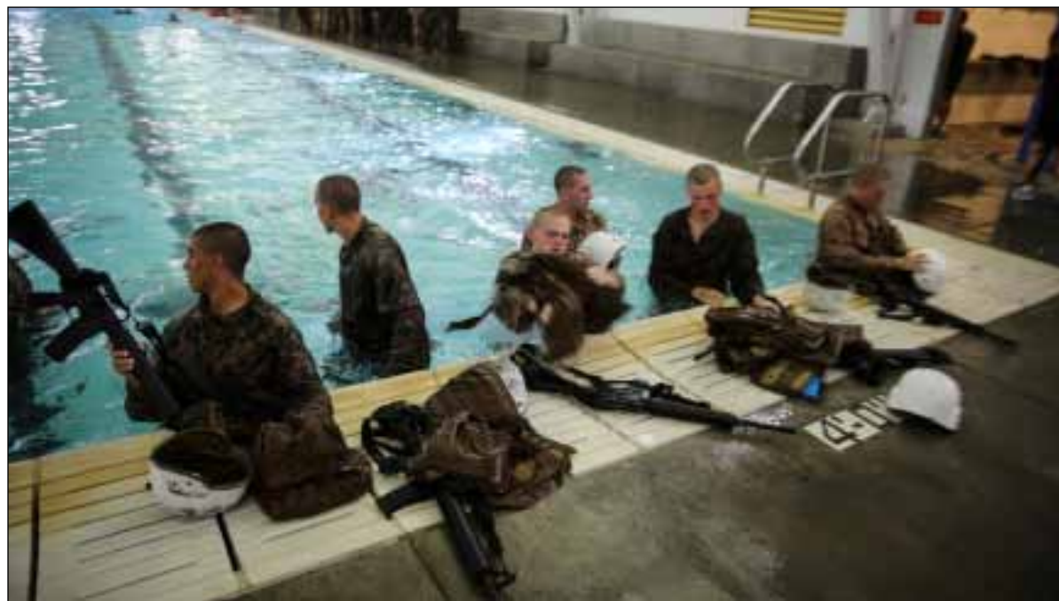
Recruits of Echo Company, 2nd Recruit Training Battalion, remove their gear and prepare to conduct the next event in swim qualification.