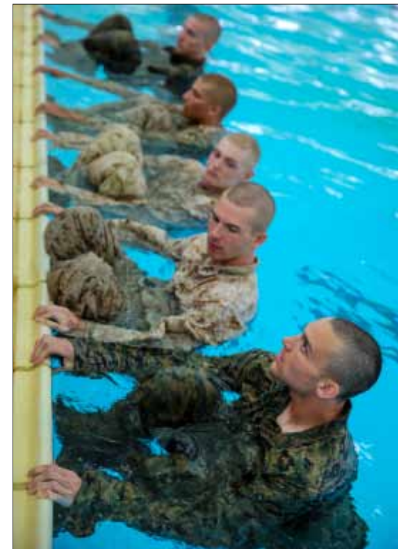
Recruits of Kilo Company, 3rd Recruit Training Battalion, await the command to begin floating. Recruits must demonstrate they can float for four minutes in order to pass swim qualification in recruit training.