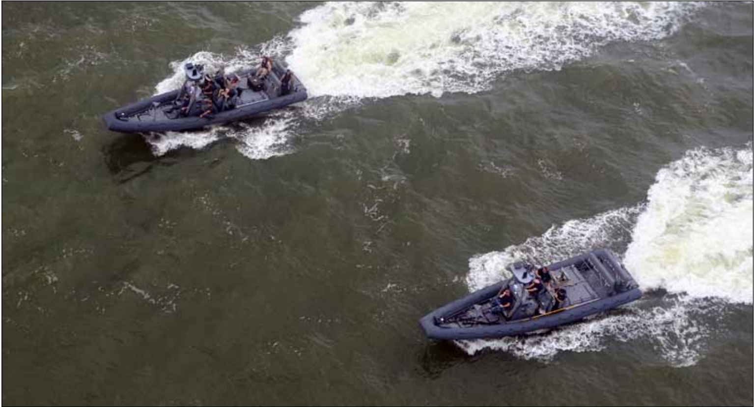
Two rigid-hulled inflatable boats, or RHIBs, from the Navy’s 8th Amphibious Squadron and Marines from the 24th Marine Expeditionary Unit’s Maritime Raid Force, Force Reconnaissance Company, 2nd Reconnaissance Battalion, stalk a simulated vessel of interest during a visit, board, search, and seizure exercise near Joint Base Langley-Eustis, Va., July 15.

After the MRF completed their mission, they were extracted by a combination of helicopters and rigid-hulled inflatable boats, or RHIBs, and returned to the command operations center for debriefing. The 24th MEU’s, RUT is a two-part exercise. The MEU will spend the rest of July conducting RUT Ground, which consists of land-based operations in and around North Carolina and Virginia.