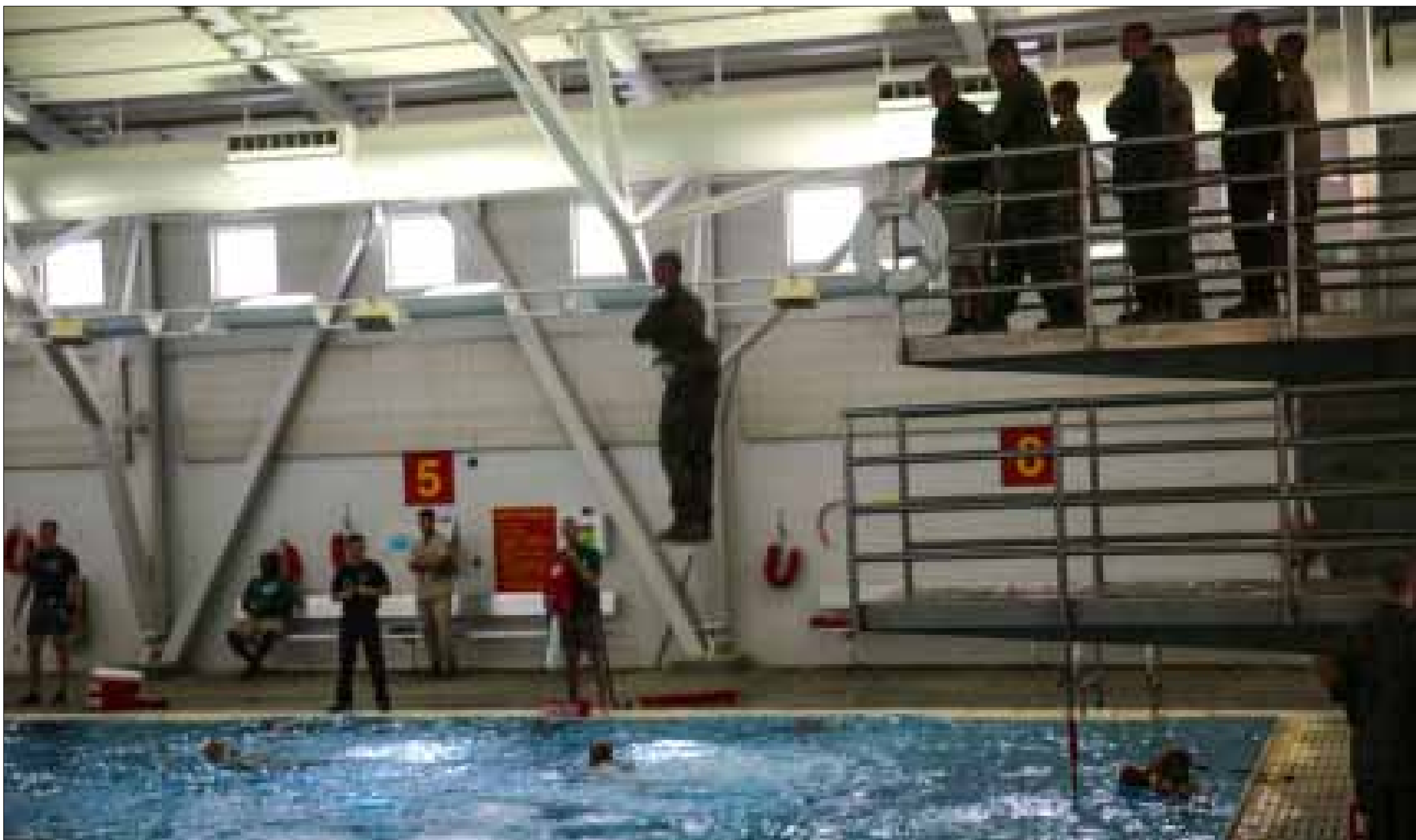
Recruits of Kilo Company, 3rd Recruit Training Battalion, conduct an abandon ship drill from a three-meter board at Marine Corps Recruit Depot San Diego, July 21. Once in the water, recruits must swim 25-meters to complete the drill.