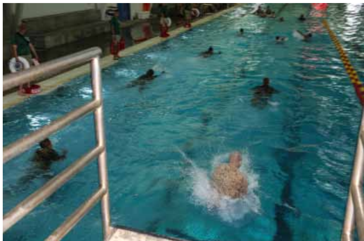
Recruits of Kilo Company, 3rd Recruit Training Battalion, practice conducting an abandon ship drill from the three-meter board at Marine Corps Recruit Depot San Diego, July 21. Recruits are required to use proper technique during the drill, otherwise it is conducted again.