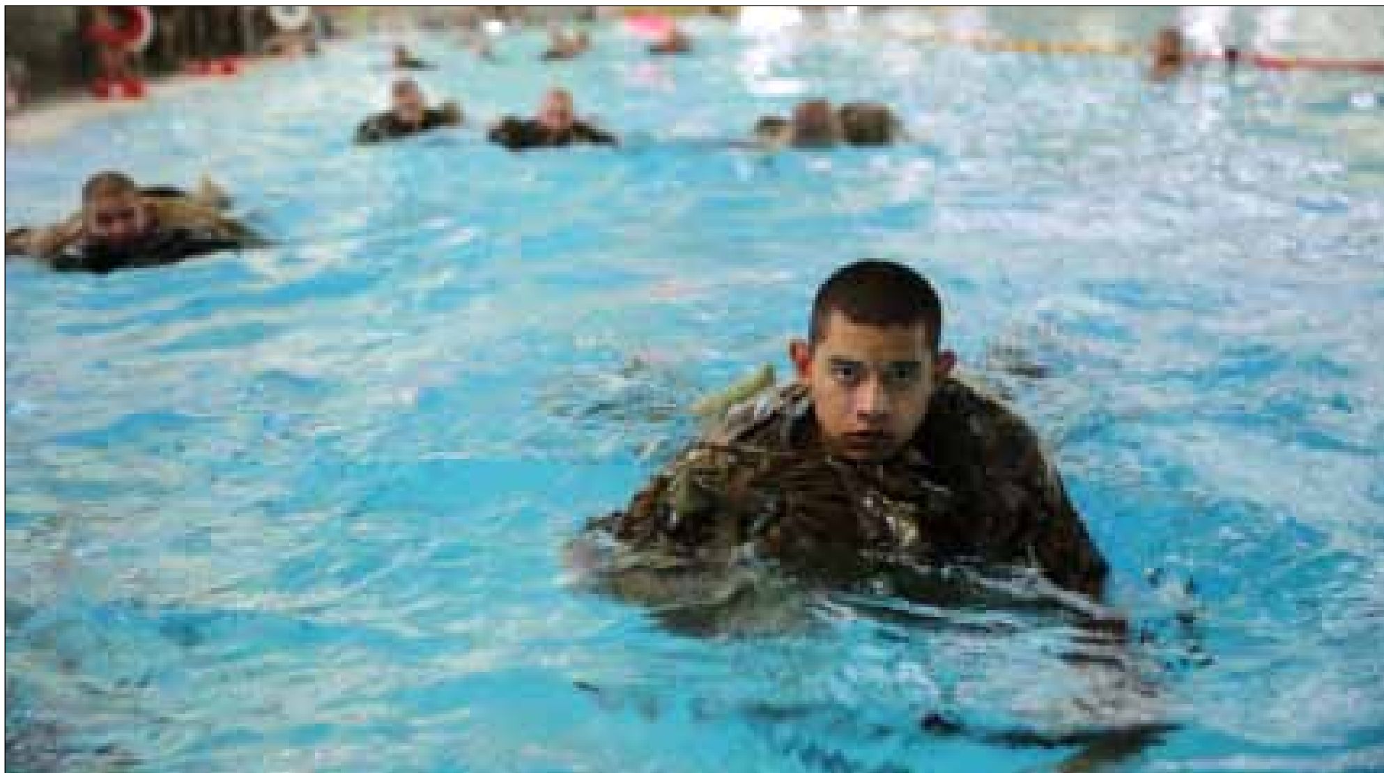
Recruits of Kilo Company, 3rd Recruit Training Battalion, conduct a 25-meter swim utilizing a back pack as a floatation device at Marine Corps Recruit Depot San Diego, July 21. The exercise was part of a swim qualification all recruits must pass in order to become Marines.