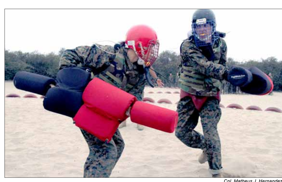
Two Company F recruits face each other during a pugil sticks match after completing the introduction to the bayonet assault course.