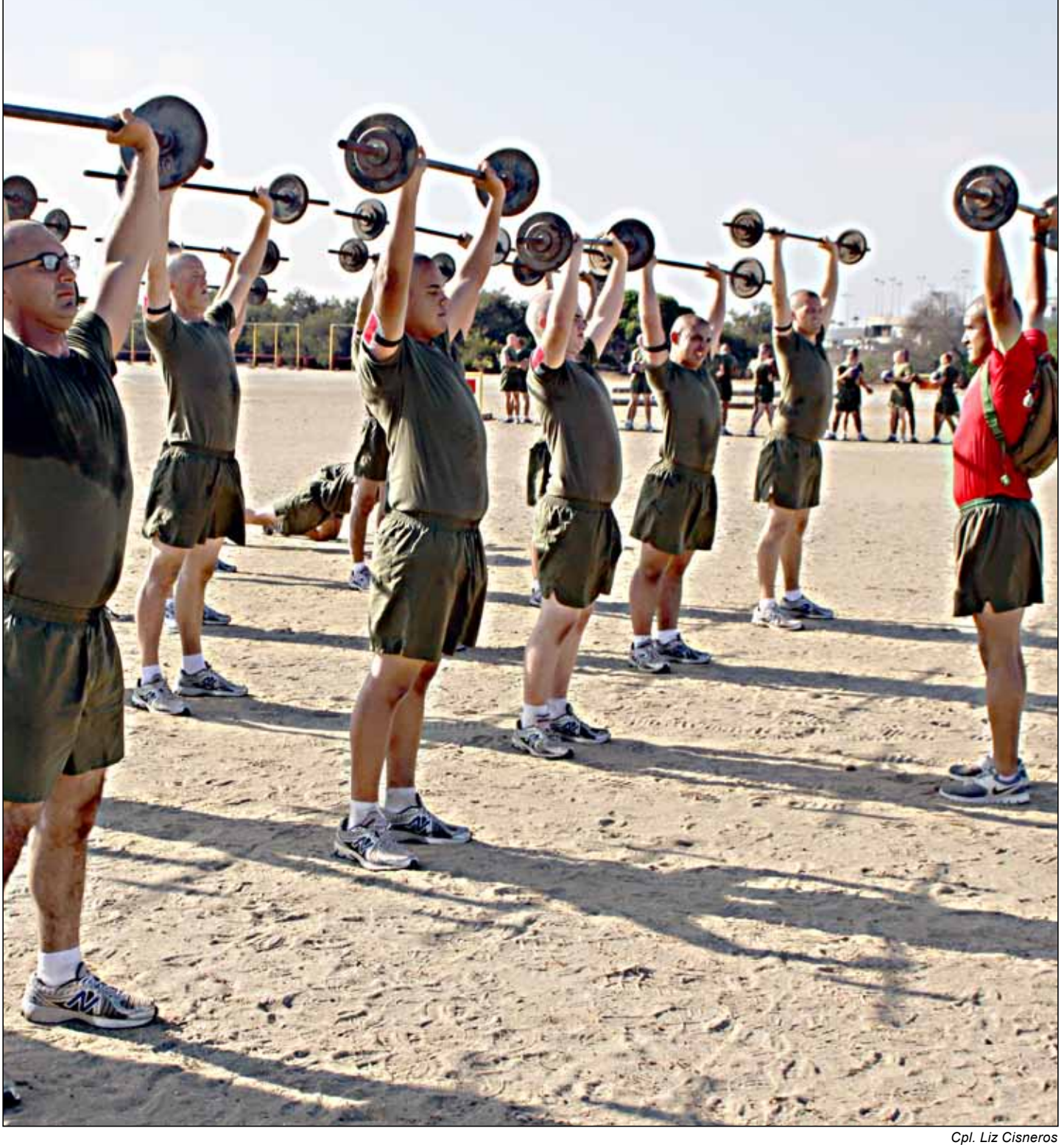
Recruits of Company B, 1st Recruit Training Battalion, perform military presses during the Bases and Circuit Course aboard Marine Recruit Depot San Diego Sept. 25. The course helps the recruits build confidence and endurance.