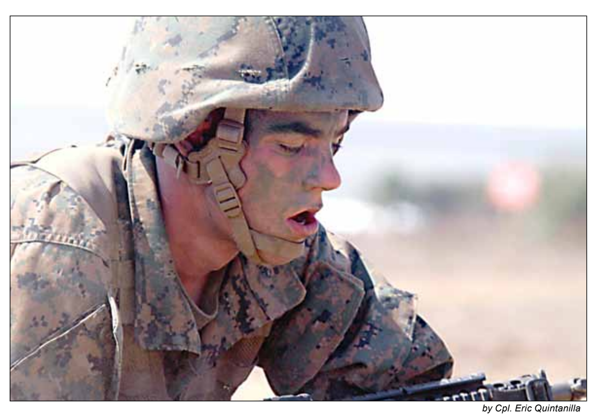
Recruits of Company H, 2nd Recruit Training Battalion, get covered in dirt as they low crawl during their training event at the Crucible Sept. 25 aboard Edson Range, Marine Corps Base Camp Pendleton, Calif. The recruits spent about an hour trying to complete 11 different exercise and obstacles before hiking off to their next event.