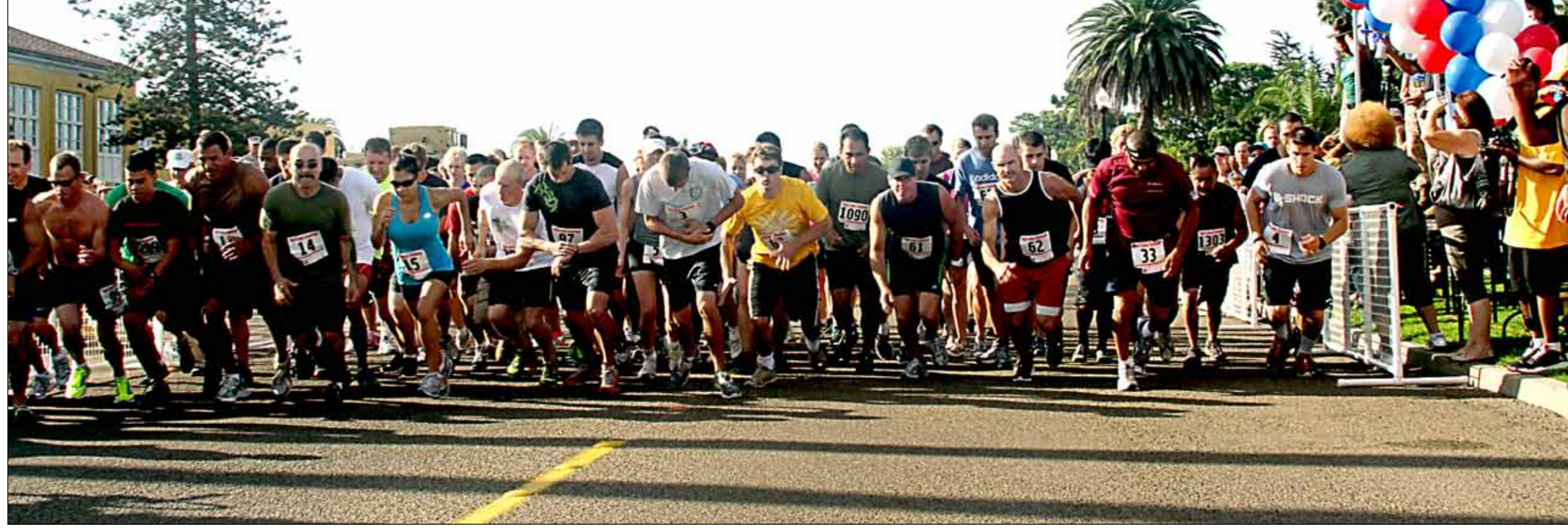
Participants in the 11th annual Boot Camp Challenge take off running at the 9 a.m. start time. The three-mile course featured 52 obstacles that included walls, logs, trenches and 60 drill instructors to motivate them through the course.

A participant runs along side a depot drill instructor with during the 11th Annual Boot Camp Challenge Sept. 29. The Boot Camp Challenge allows civilians to experience a small portion of Marine Corps recruit training through some of the obstacle courses Marines have endured.