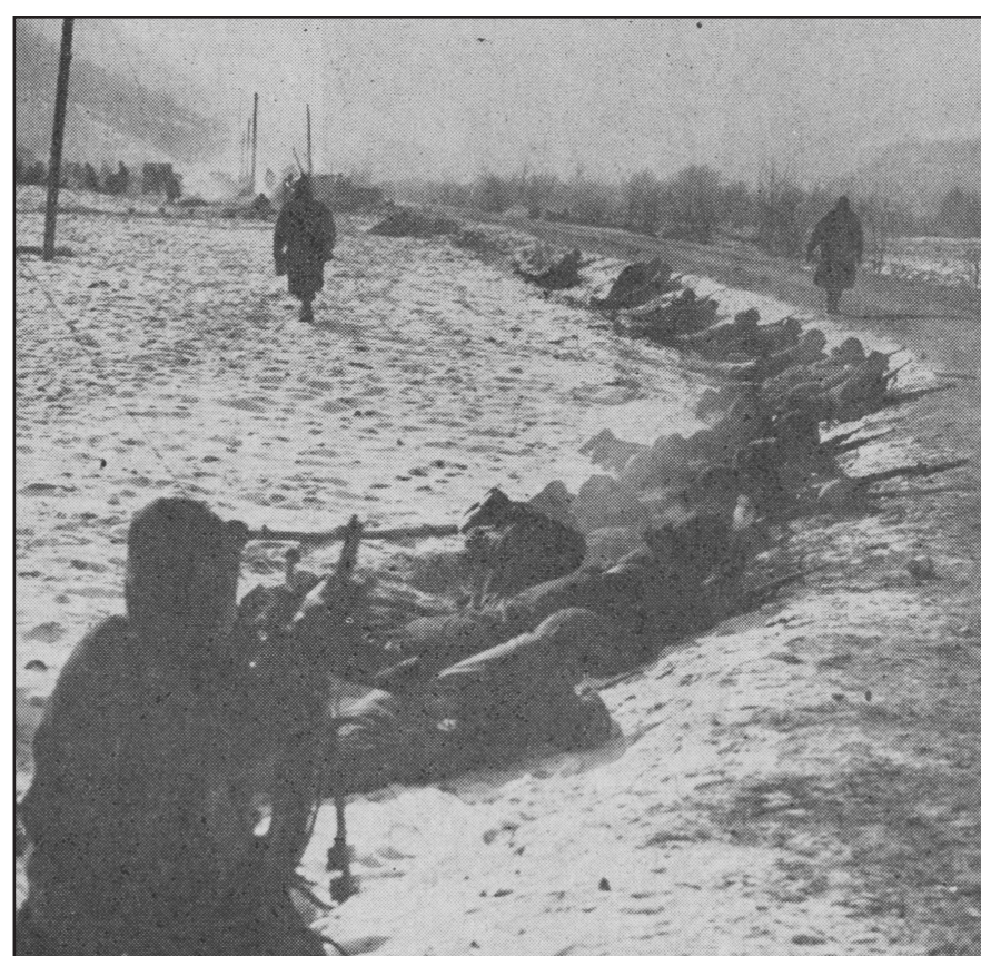
Red and white battlefield: One of the last Marine units to withdraw from North Korea fights a rear-guard action against overwhelming forces of Chinese Reds (Jan. 5, 1951).