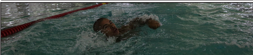
Recruits of Mike Company, 3rd Recruit Training Battalion, conduct Water Survival Basic Qualification at Marine Corps Recruit Depot San Diego, Oct. 14. Recruits were instructed to not touch the bottom of the pool at any time during the swim or they would instantly fail and have to return for remedial training and try again. Mike Company will graduate Dec. 11, 2015.