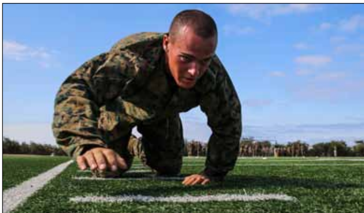
A recruit from Mike Company, 3rd Recruit Training Battalion, high crawls during the maneuver under fire portion of the Combat Fitness Test at Marine Corps Recruit Depot San Diego, Calif., Aug. 7. The maneuver under fire is one of three exercises included in the CFT, and scores are kept on their military record for promotional purposes in the Fleet Marine Force.