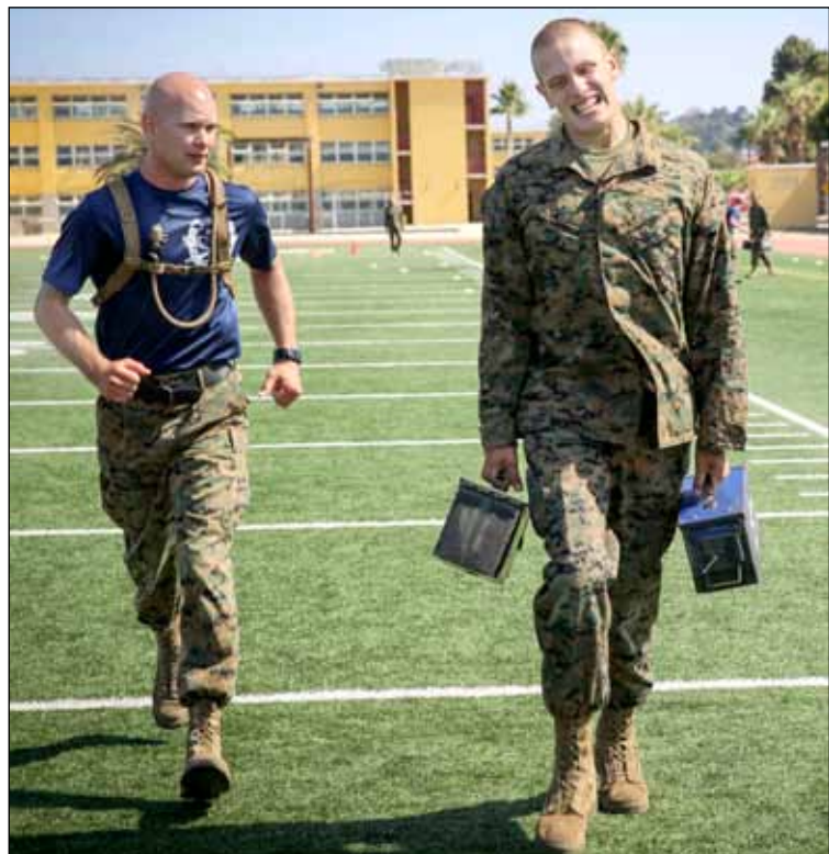
A recruit from Mike Company, 3rd Recruit Training Battalion, carries ammunition cans during the maneuver under fire portion of the Combat Fitness Test at Marine Corps Recruit Depot San Diego, Calif., Aug. 7. The maneuver under fire requires a low crawl, high crawl, fireman's carry and the transportation of ammunition cans.