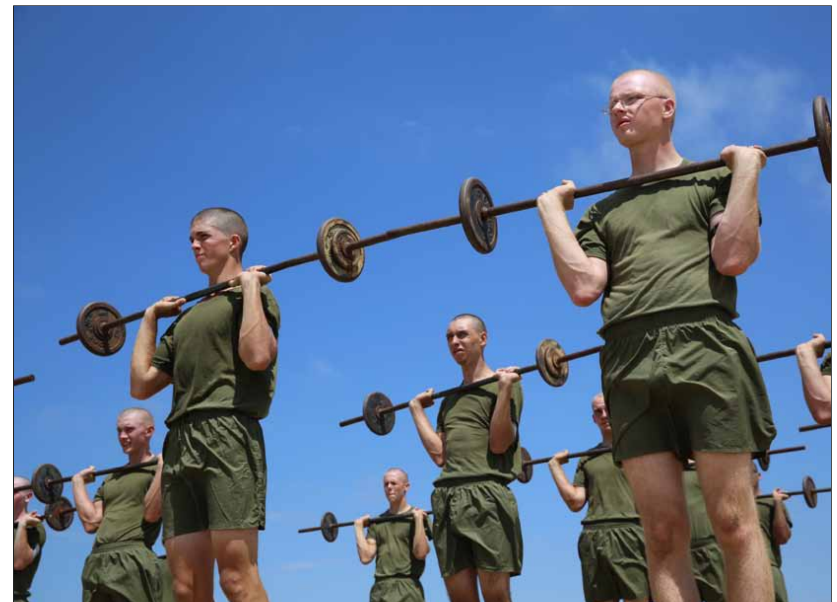
Echo Company recruits perform military presses at the Circuit Course weight lifting station. The Circuit Course helps recruits learn how to overcome what they think are their physical limits.