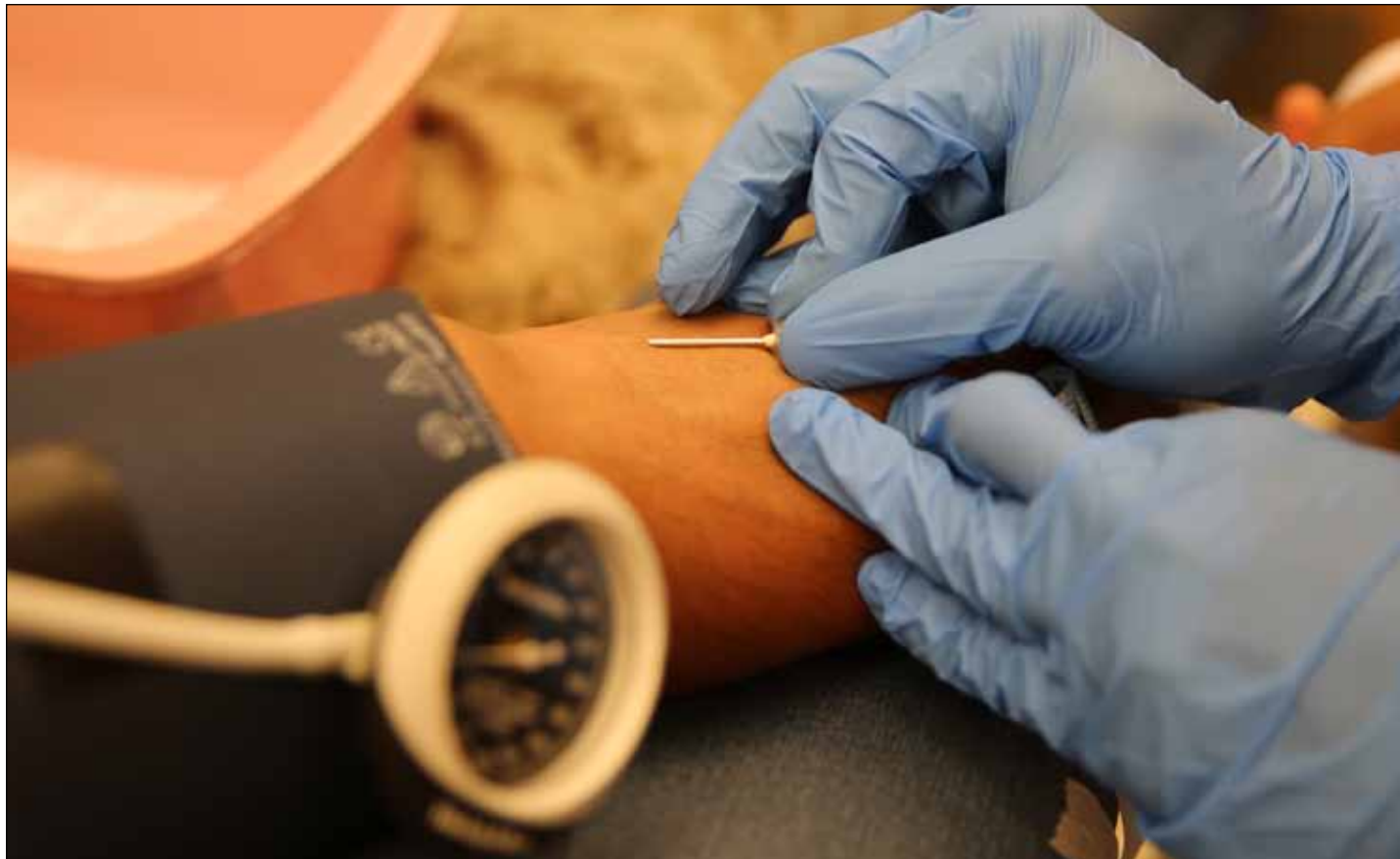
The attendant from Naval Hospital San Diego inserts a needle into a recruit from Alpha Company, 1st Recruit Training Battalion, to collect a pint of whole blood that will be used to treat medical emergencies or care for military members undergoing surgery. The whole blood may also be broken down into its component plasma and solids for use throughout the military medical system.