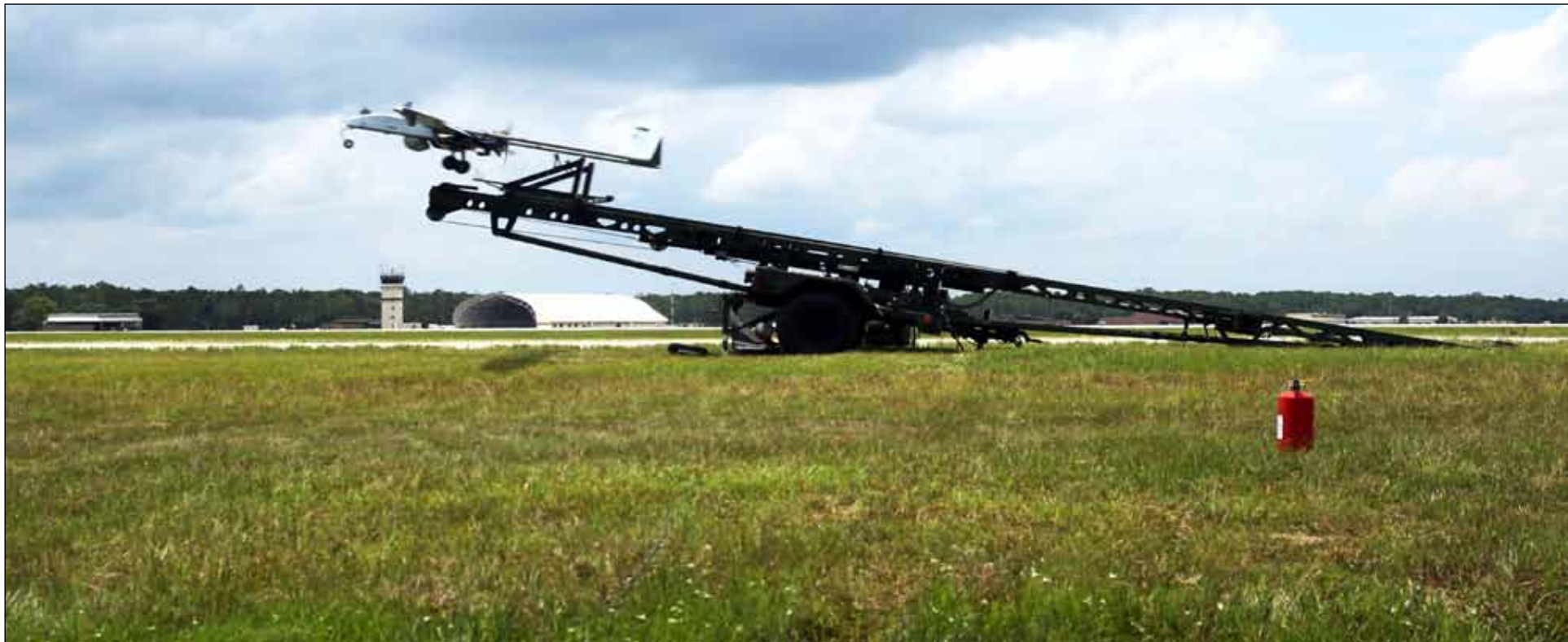
An RQ-7 Shadow unmanned aerial vehicle launches for a training mission at Avon Park Air Force Range, Fla., Aug. 4, 2014. Marine Unmanned Aerial Vehicle Squadron 2 conducted a 10-day field exercise, conducting both deep and close air support with the Shadow system.