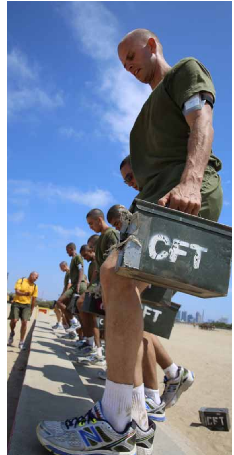
Recruits of Echo Company run up and down stairs holding two ammunition cans. Before recruits began the Circuit Course, they ran a mile and a half with their platoons.