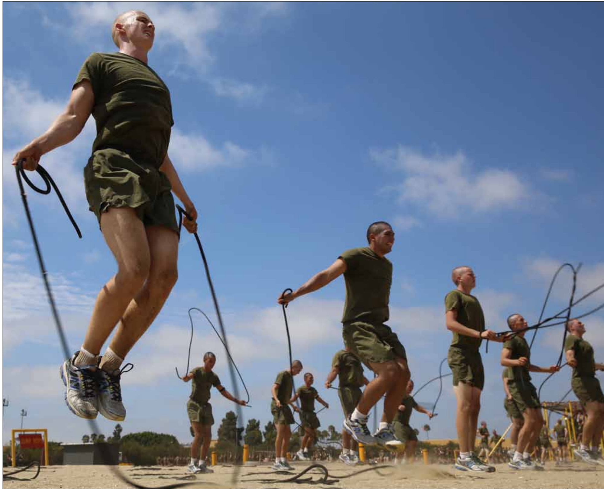
Recruits of Echo Company, 2nd Recruit Training Battalion, jump rope at one of the stations in the Circuit Course at Marine Corps Recruit Depot San Diego, Aug. 11. Recruits were split up into groups of 15, and for 30 seconds, they pushed themselves as hard as they could.