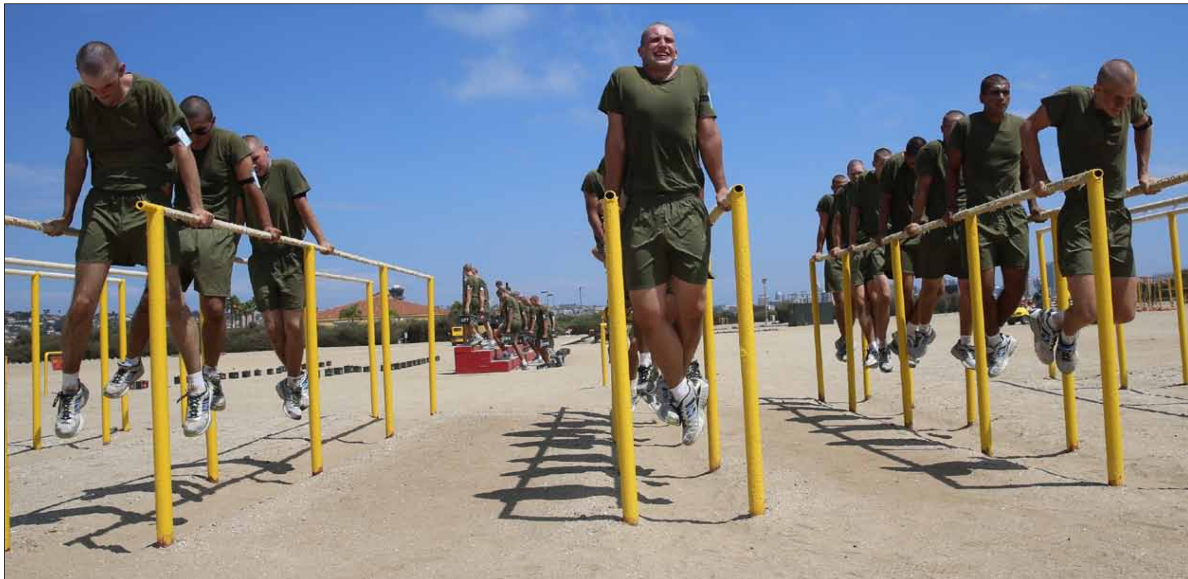
Echo Company recruits conduct dips at one of the Circuit Course stations. Once recruits completed the initial mile-and-a-half run on the course, they moved on to the exercise stations where a drill instructor was waiting to demonstrate the proper way to perform the exercise for that station.