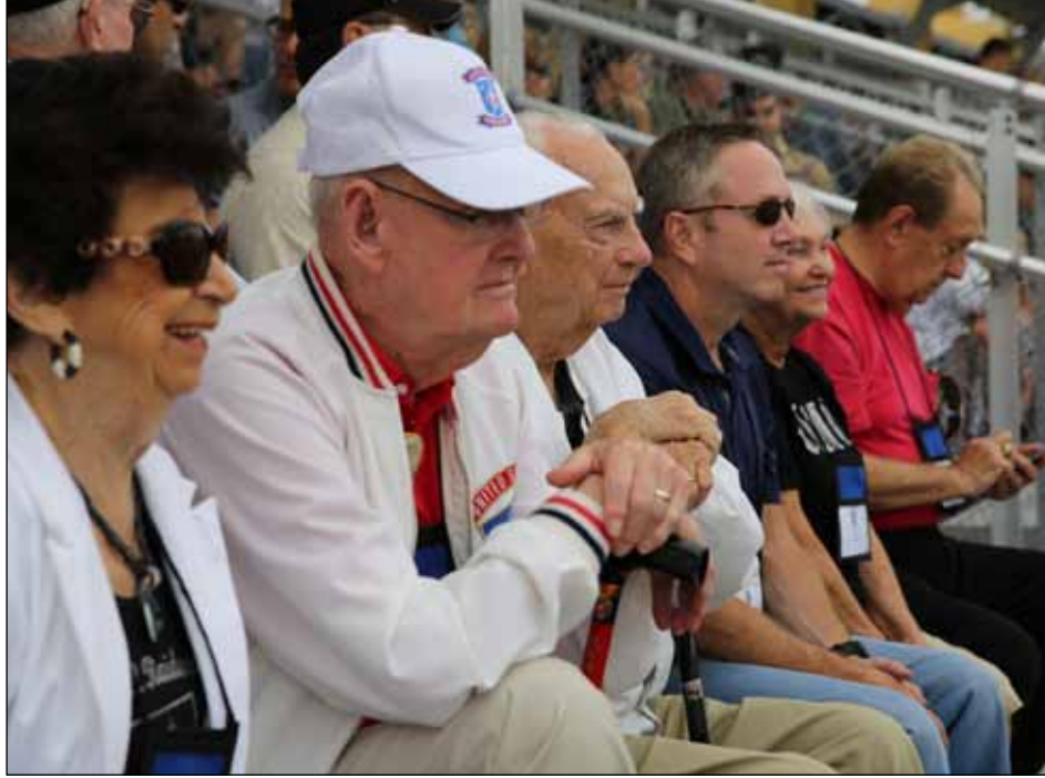
As part of their annual reunion, members of the Marine Raider Association observe the graduation ceremony for new Marines of Company D, 1st Recruit Training Battalion, at Marine Corps Recruit Depot San Diego Aug. 8. Formed on the brink of World War II, the Marine Raiders are considered to be the originators of Marine Corps special operations.