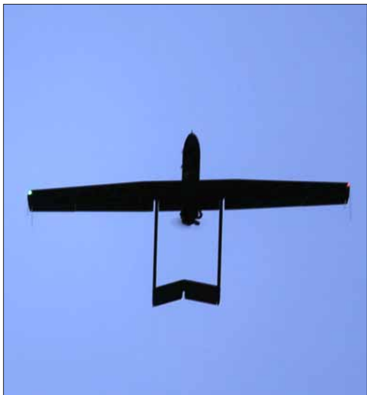
A RQ-7B Shadow unmanned aerial vehicle flies overhead during training at Avon Park Air Force Range, Fla., Aug. 4, 2014. The Shadow belongs to Marine Unmanned Aerial Vehicle Squadron 2, which conducted a 10-day field day exercise to increase the proficiency and readiness of the squadron.

“At Cherry Point there is a lot of support available in the local area,” said Cossette, a Flagler Beach, Fla., native. “This gets us used to operating with very little external support which is usually the case when Marines are deployed.”