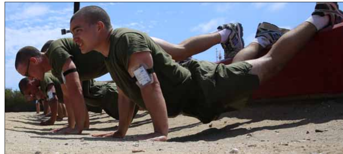
Echo Company recruits perform inclined pushups while running the depot's Circuit Course Aug. 11. The Circuit Course is comprised of more than 20 exercise stations, each with its own purpose. These exercises included monkey bars, jump ropes and weight lifting.

Tired, dirty and weak, recruits of Echo Company have completed their first physical test and will continue on the path the becoming Marines.