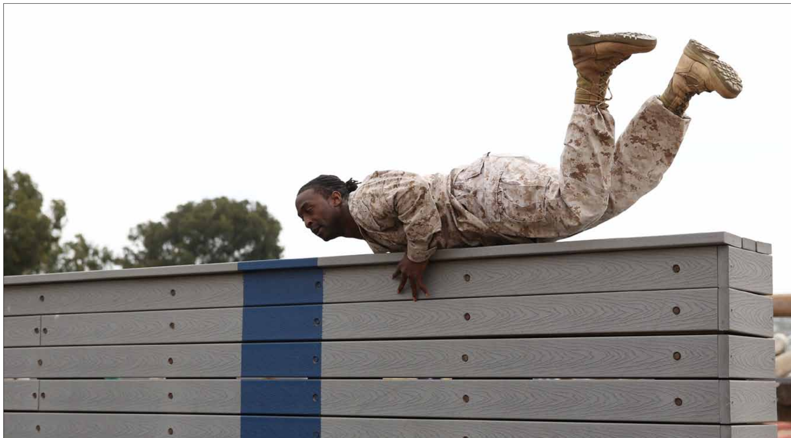
Charles Tillman, cornerback for the Chicago Bears of the National Football League, throws himself over an obstacle while running the depot's obstacle course during his visit to the Marine Corps Recruit Depot San Diego July 1.