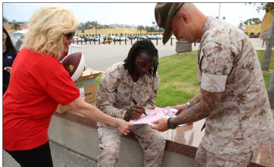
National Football League pro Charles Tillman of the Chicago Bears toured the depot and signed autographs for Marines and their families July 1.

"I enjoy rocking with the fellas and hearing their stories on why they joined the Marine Corps," said Tillman. "I've got see some of the different things on what it means to be a Marine, like the D. I. creed and hearing it from the Marines themselves."