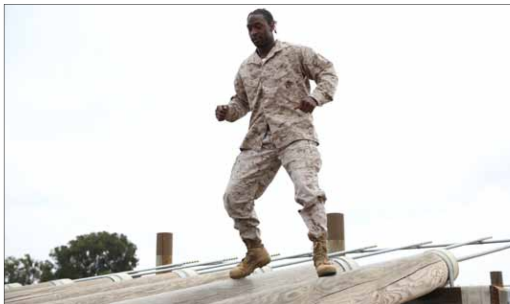
Charles Tillman, Chicago Bears cornerback, maneuvers over, under and through obstacles on the depot obstacle course during his July 1 visit. After completing the course, he toured the depot and signed autographs for fans.