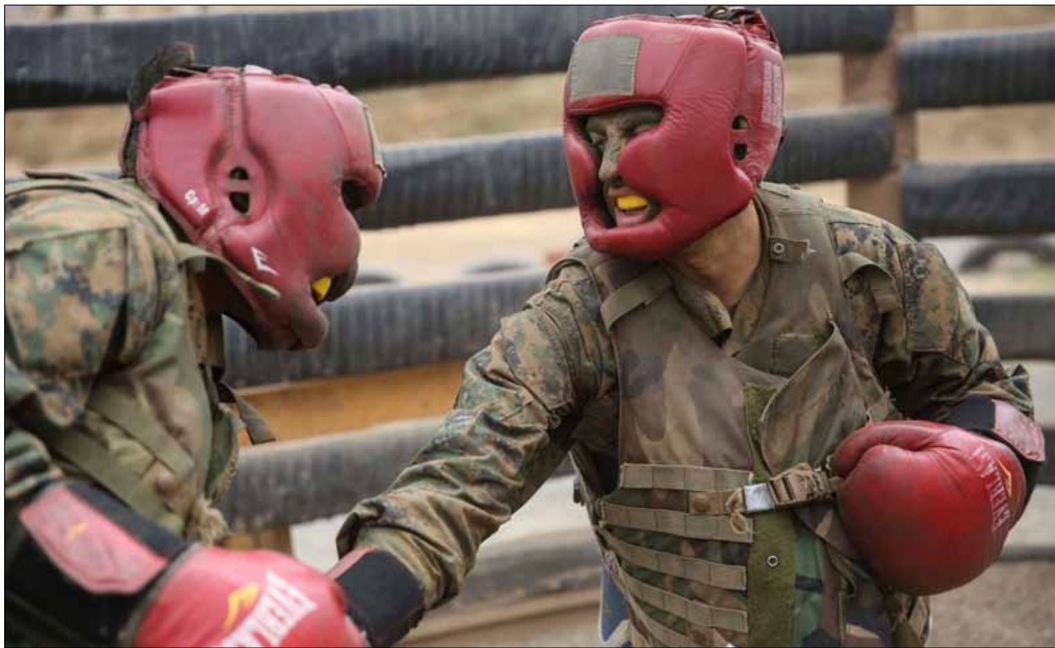
Recruits of Bravo Company, 1st Recruit Training Battalion, exchange punches during a body sparring exercise at Marine Corps Base Camp Pendleton, Calif., July 1. The boxing was supervised by Marine drill instructors and ended if a recruit hit his opponent above the shoulders.