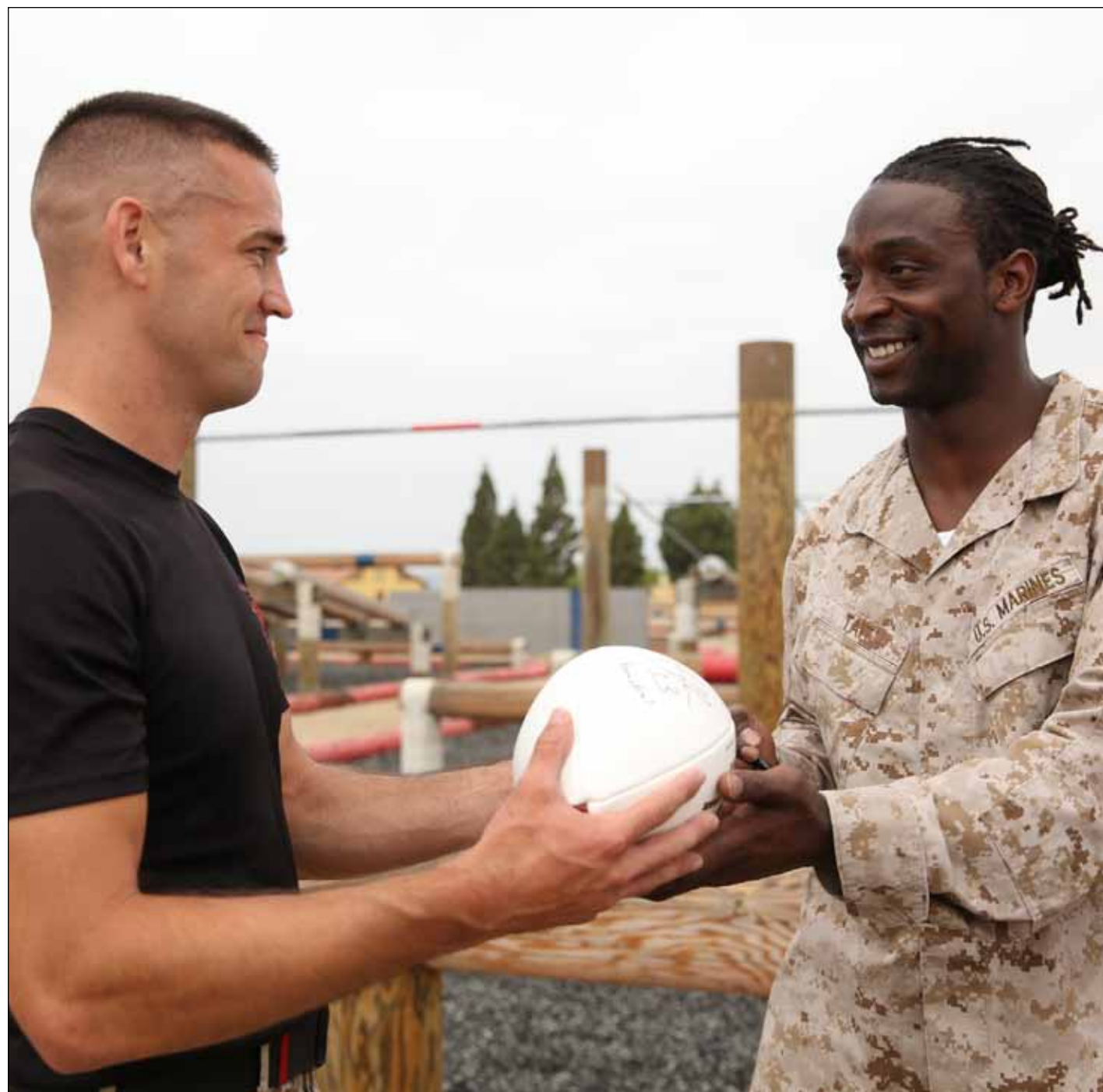
Charles Tillman autographs a football for a Marine during his visit to the depot. Tillman said he especially enjoyed socializing with the Marines.