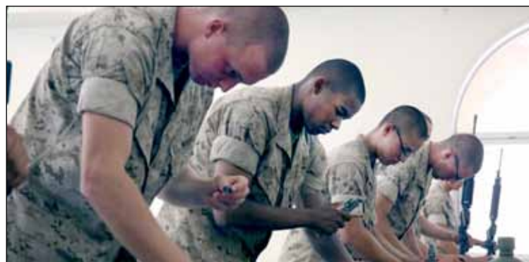
Recruits of India Company, 3rd Recruit Training Battalion, take the weapon assembling and disassembling portion of the Practical Application exam, July 7.