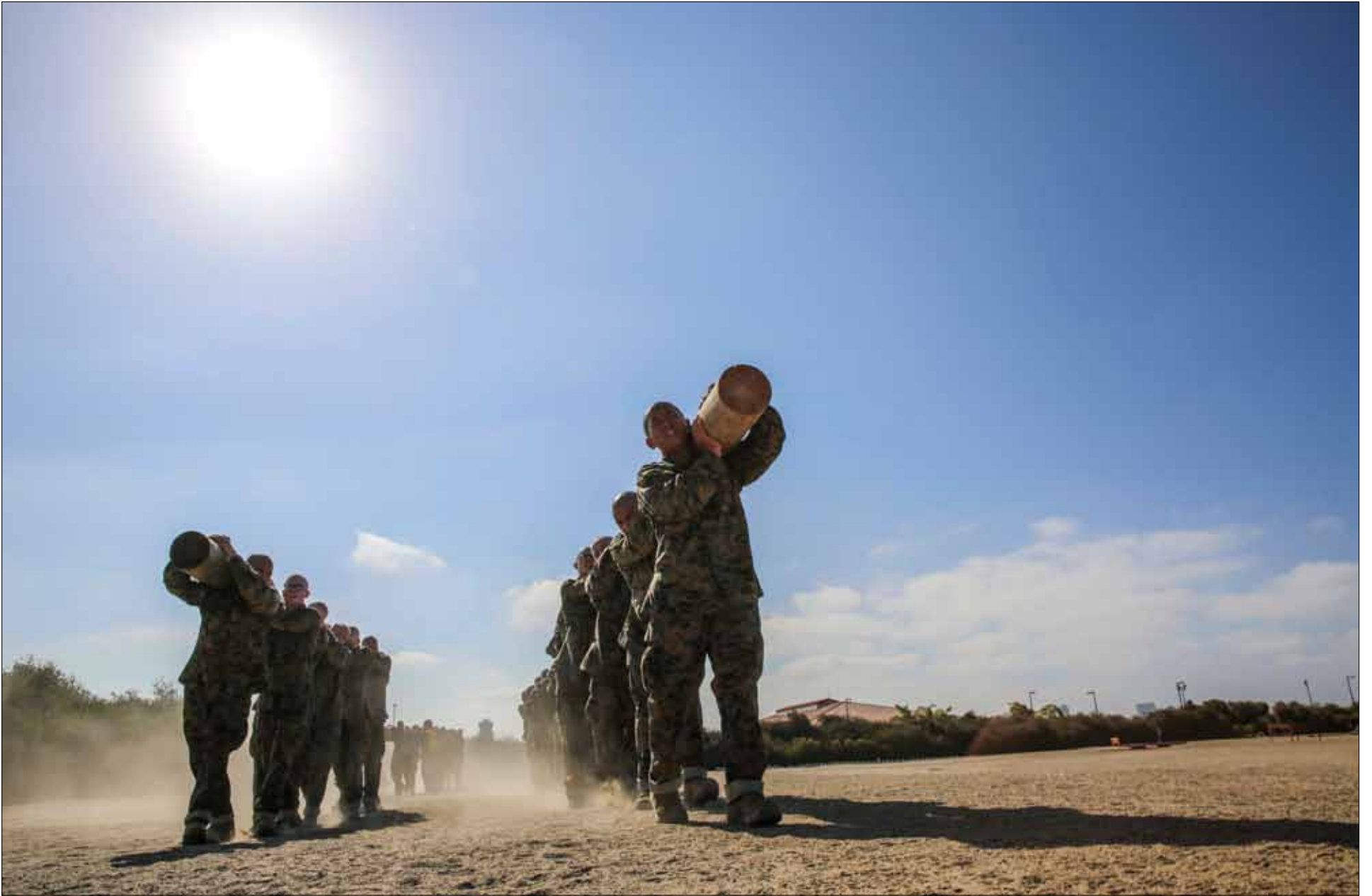
Recruits of Golf Company, 2nd Recruit Training Battalion, work together to finish a log drill exercise aboard Marine Corps Recruit Depot San Diego, Calif., July 8. The log drill exercise is one of many training events required for graduation from Marine Corps recruit training.