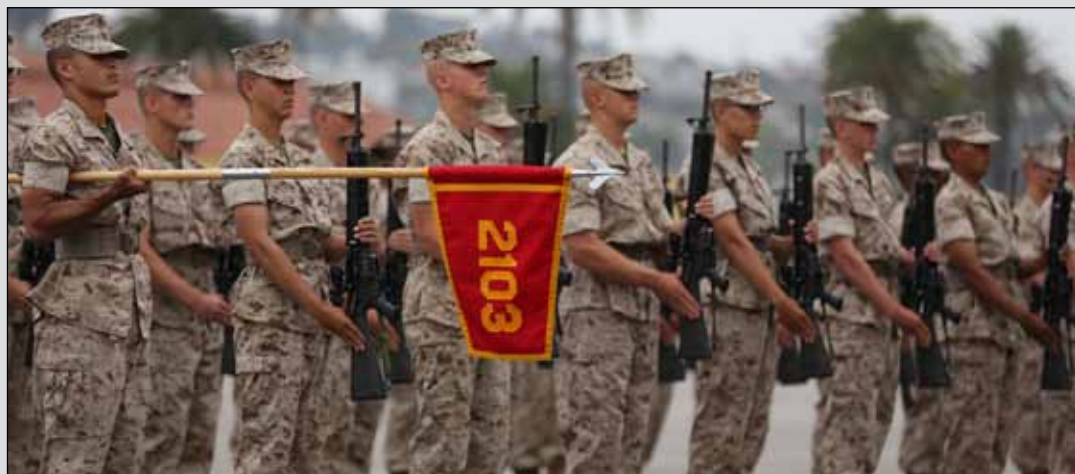
Recruits of Platoon 2103, Echo Company, 2nd Recruit Training Battalion, execute the Present Arms drill movement during Final Drill aboard Marine Corps Recruit Depot San Diego, Calif., June 30. Platoons perform drill movements in formation and while marching during Final Drill.