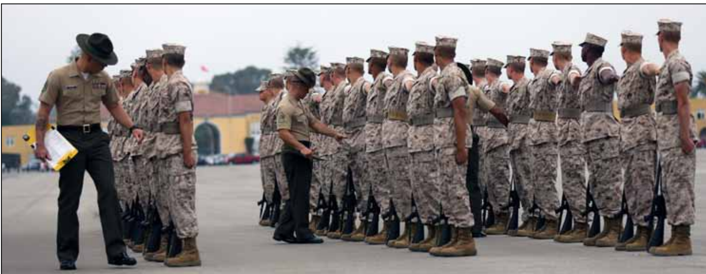
Drill masters grade recruits of Echo Company, 2nd Recruit Training Battalion, on their uniforms and positioning during Final Drill aboard Marine Corps Recruit Depot San Diego, Calif., June 30. Every platoon is graded in the event.

"You can't always depend on your weapon," said the Salt Lake City native. "You have to be able to hold your position should your weapon malfunction. The experience wasn't bad, it was a good fight, and I got in a couple good punches."