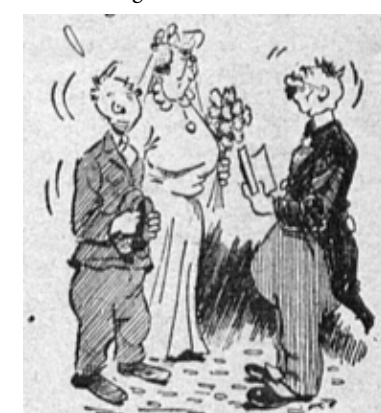
...Dan Cupid is hitting

CAMP ELLIOTT.-The new recruits from Boot Camp are taking the rigorous physical training in easy strides and will soon be able to stand beside their Icelandic buddies, they seem to be able to hold their own in the shooting matches.