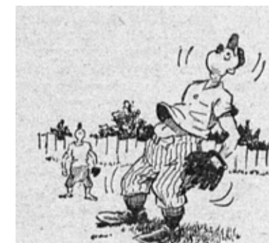
...home runs were the feature