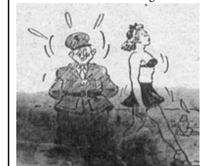
...to interest them in Los Angeles

CAMP ELLIOTT.-Things in general have been quiet around "I" Co., but since the forty-eight over the week-end have been coming a bit