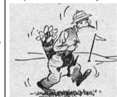
... shot two birdies