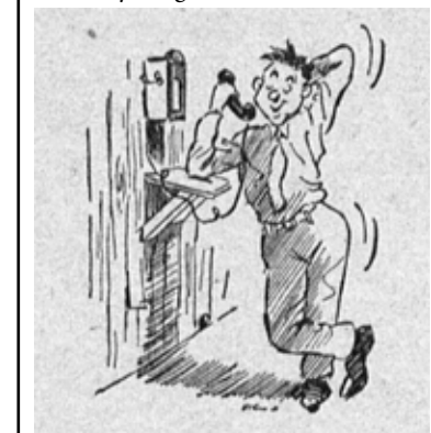
... long distance phone calls