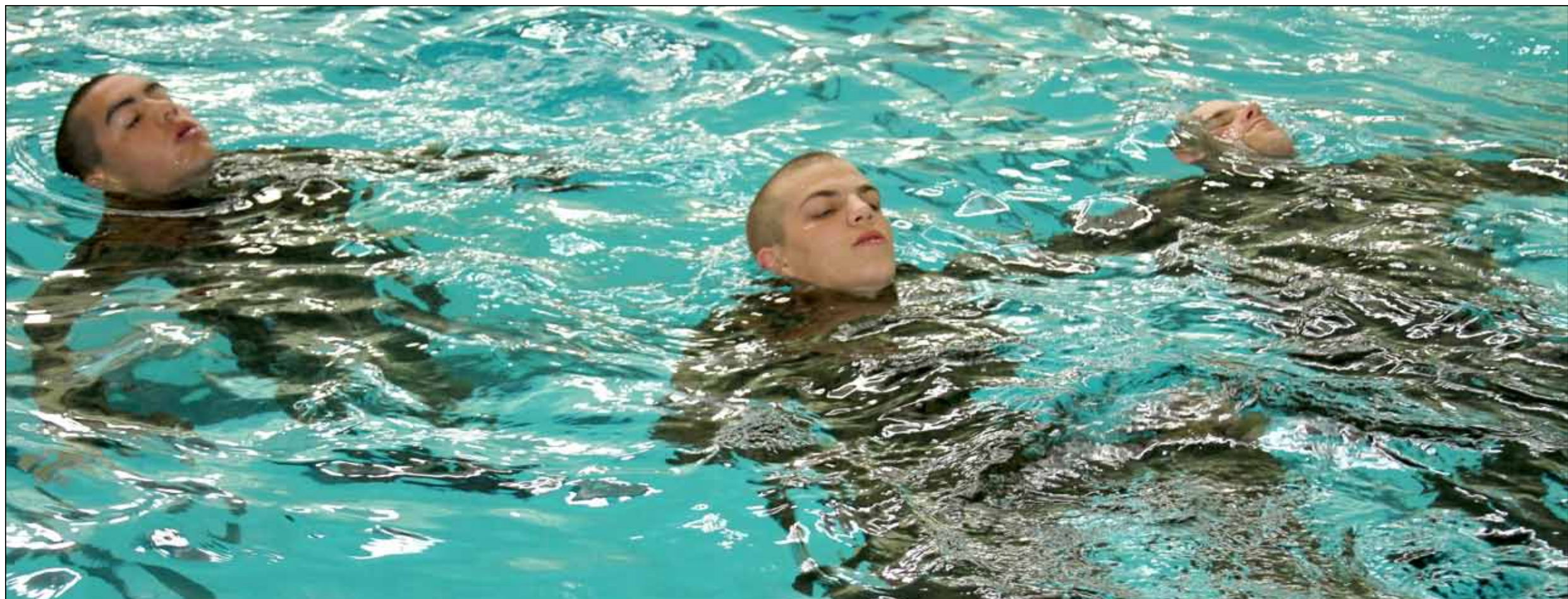
Recruits of Company K, 3rd Recruit Training Battalion, tread water for four minutes in the deep end of the pool during Water Survival Basic aboard Marine Corps Recruit Depot San Diego Jan. 7. Recruits learn how to utilize their gear around themselves if they were to fall overboard.

Recruits of Co. K were drenched in relief after completing one of the final events in their first phase of training. Now, with the knowledge and skills of Water Survival Basic, recruits move on to their next challenge in recruit training—marksmanship—which will take place at Edson Range aboard Marine Corps Base Camp Pendleton, Calif.