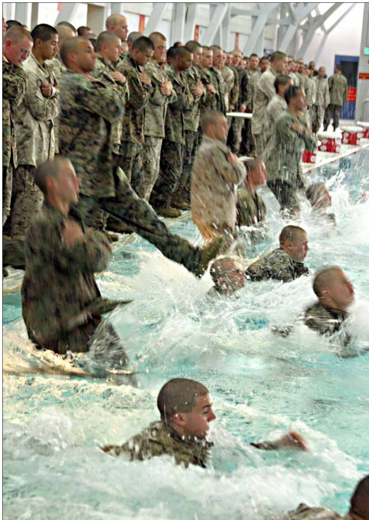
Recruits of Company K, 3rd Recruit Training Battalion, jump into the water for their first portion of Water Survival Basic aboard Marine Corps Recruit Depot San Diego Jan. 7. They are required to swim 25 meters in the shallow end of the pool in a full combat utility uniform and combat boots.