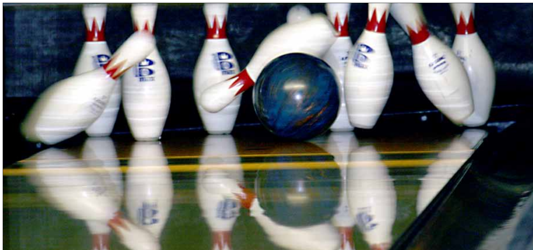
Lance Cpl. Crystal Druery